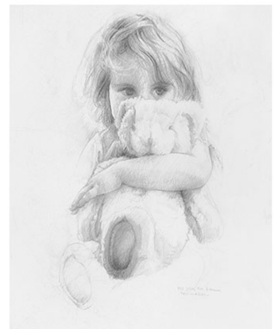
I. Hideaway giclee' $85 US/ $115 Cdn