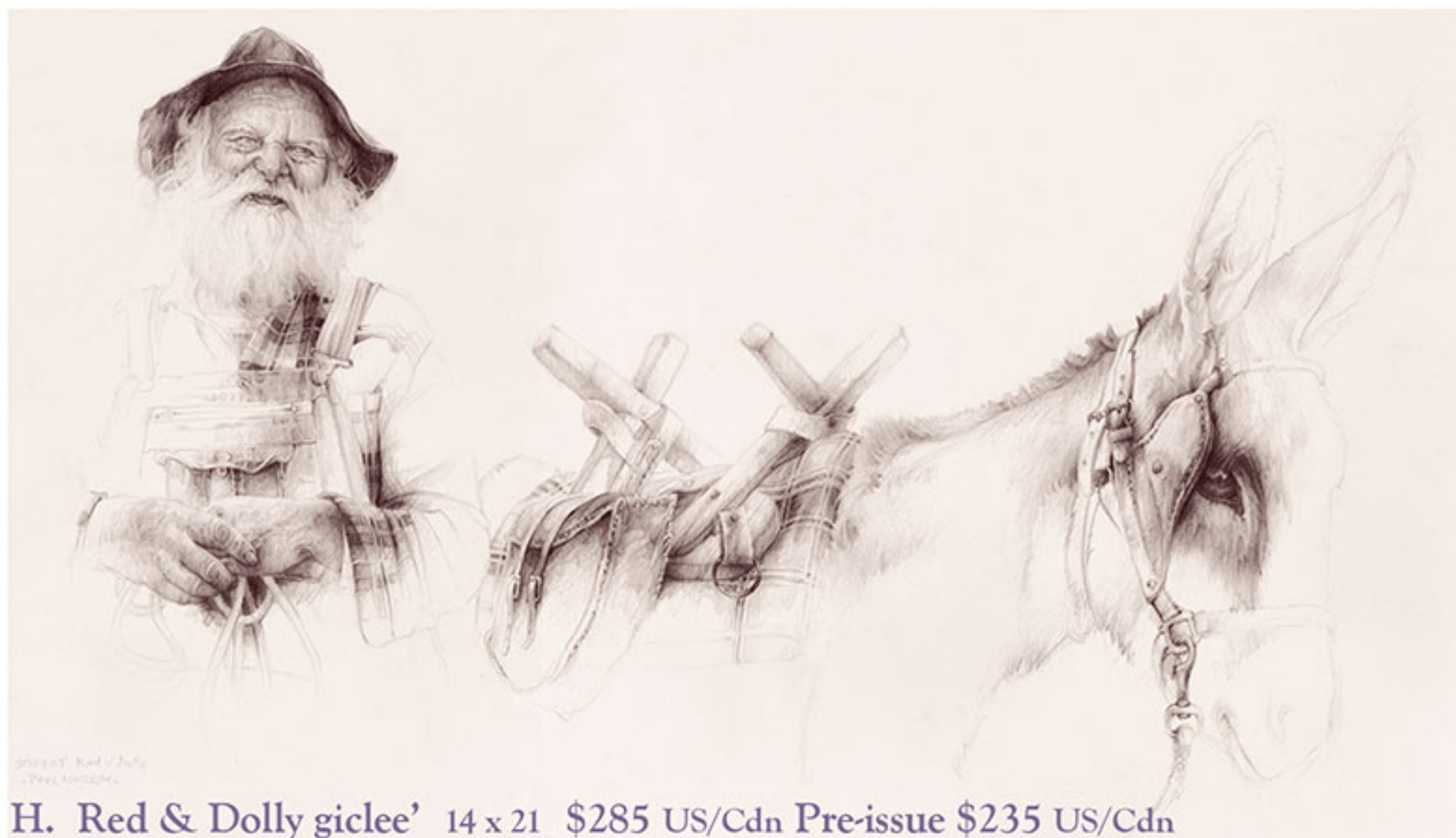
H. Red & Dolly giclee' 14 x 21 $285 US/Cdn Pre-issue $235 US/Cdn