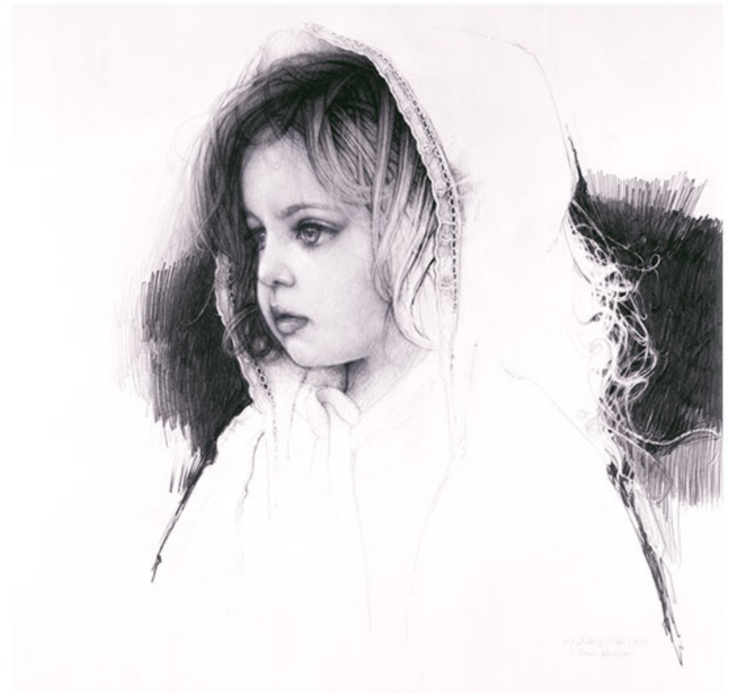
B. Lil Miss giclee'paper 16 x 14 Secondary $275 US C. Original** Giclee'Framed 36 x36 issue 175 $2550US/Cdn