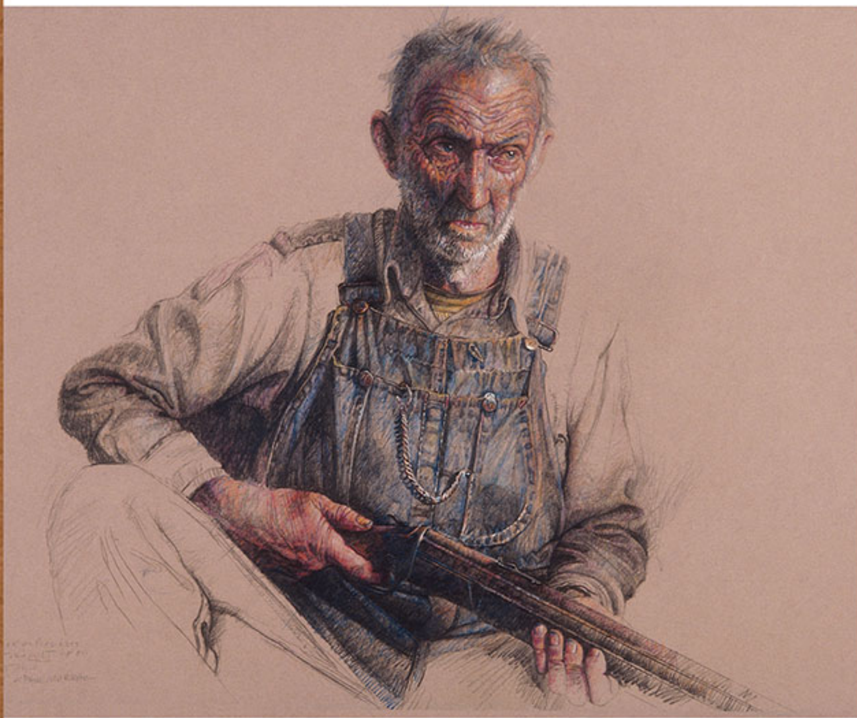
A. Gunslinger paper giclee' (cropped) 13 x 21 $245US/ $275Cdn