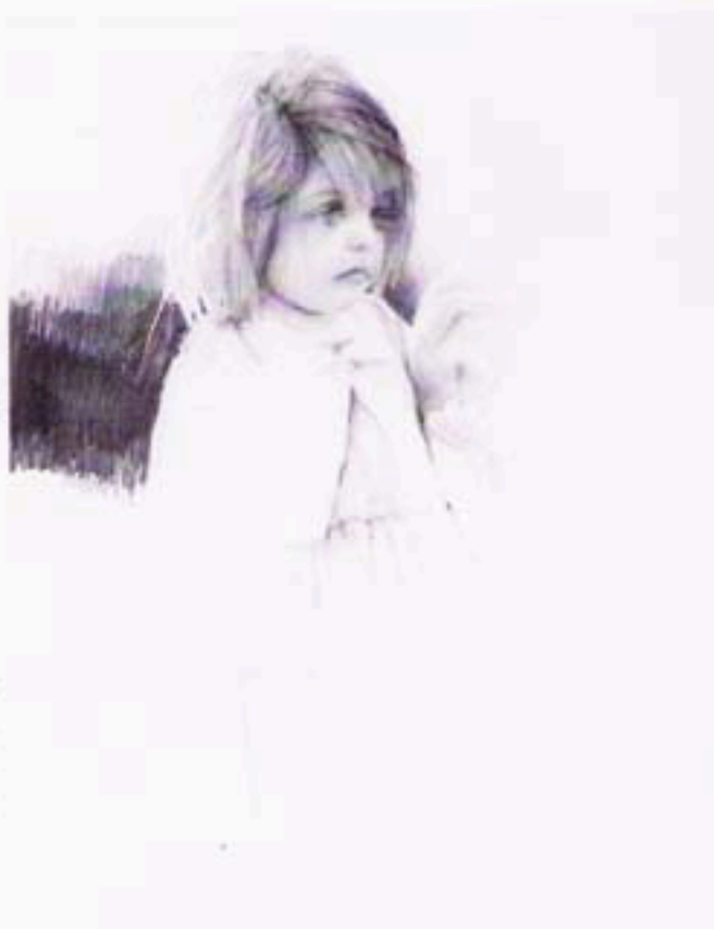
"Briar Patch" New release

the very best when reproducing his "limited editions". Now, he brings you the highest resolution imaging available in today's market. Using 200 yr (lasting) inks and the finest quality 100% rag archival artist paper, he is able to present for you, the very best match to the original that can exist today, a Giclee'. The inks give the picture longevity and a translucence quality of capturing light similar to the original. Paul has personally painted individual detail on each one, contributing to the uniqueness of these Original-Giclee' limited edition.